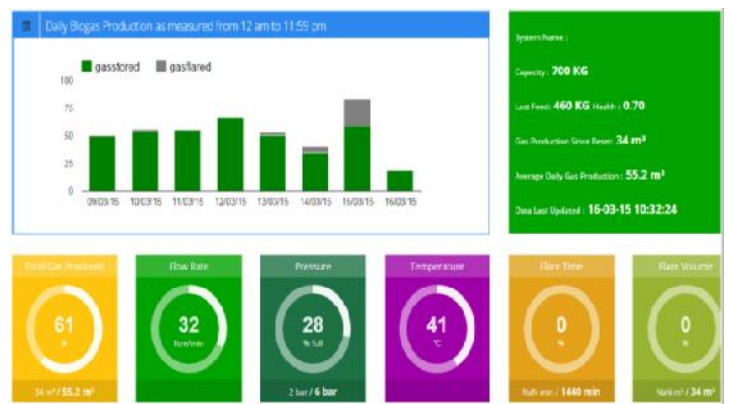
Figure: Snapshot of GPS' plant performance monitoring dashboard offered to clients